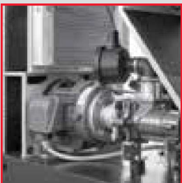
Low noise levels

Both the new elements (direct coupled) combined with the deep sound insulation results in a very low sound level