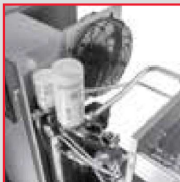
Easy and fast maintenance

Both the new elements (direct coupled) combined with the deep sound insulation results in a very low sound level