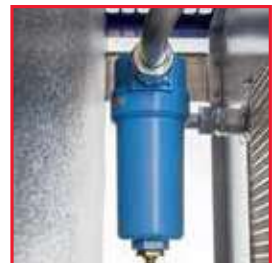
Quality air package

The new generation of elements combined with the new converters and the highly efficient transmissions result in high flexibility and efficiency